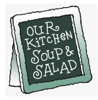
TIP of the MONTH